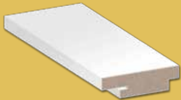
Quality One Piece Cellular PVC Residential Jambs

Add beauty to your door with a choice of clear or decorative door lites. Our decorative door lites come with a ten-year warranty. Please contact your local Elixir Division or Elixir Distributor to inquire about Elixir Entrance Doors.